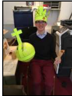
Outgoing Organ Scholar