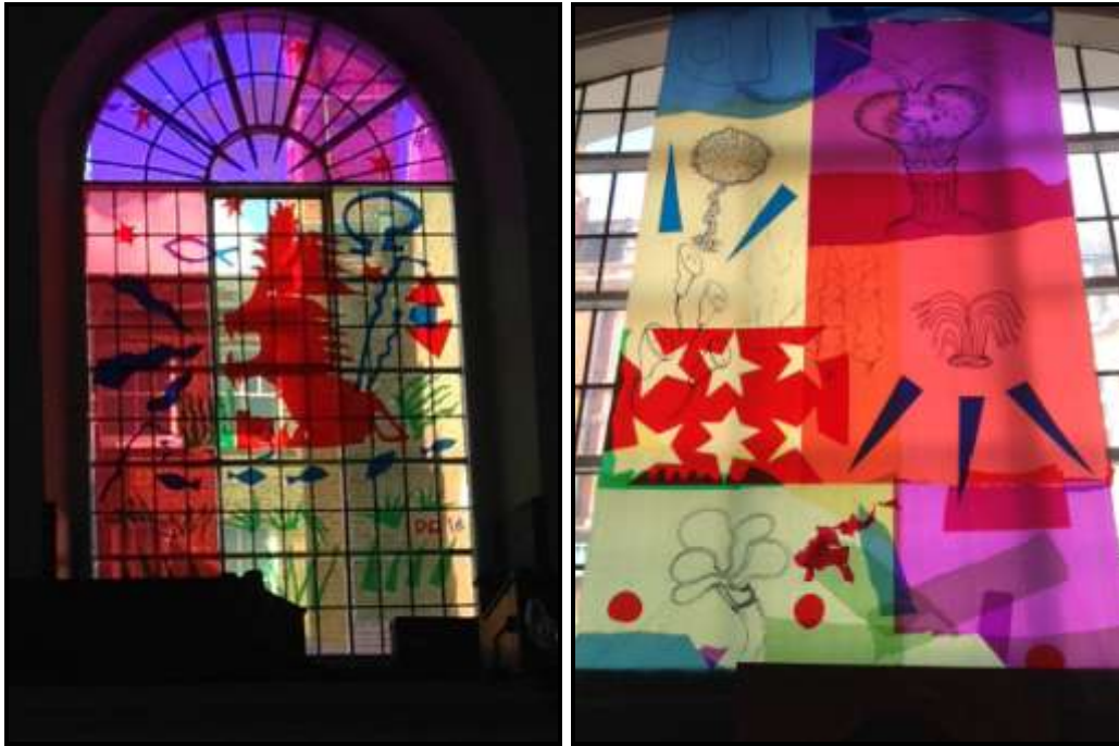
Some of the exhibits inspired by stained glass