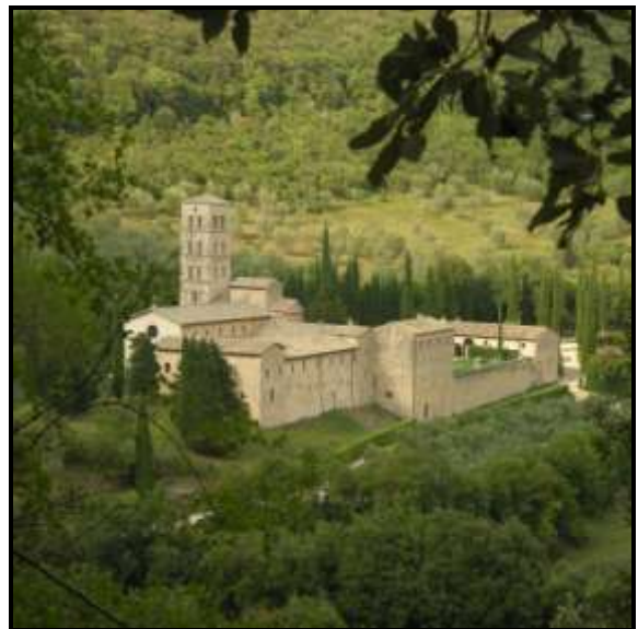
The Abbey of San Pietro in Valle, untouched by earthquakes

In sum, our Pilgrimage is as ever at the Chapel, an active and joyously rich one, working on two key fronts: (a.) consolidating the relationships we already have formed with married couples, baptism families, our existing community; (b.) looking beyond to see how new future relationships could be created both through outreach and creative ways of using the space with which we are blessed in the service of others.