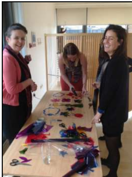
Staff from Grosvenor Estates taking part in an art workshop

The opening night of the exhibition! The Chapel joined forces again with The Royal Academy of Arts to present art inspired by the exhibition at the Royal Academy 'The Modern Garden: Monet to Matisse'. Participating artists came from local businesses and residents, St George's School, the RA's club for vulnerable adults and we welcomed back the young artists who previously presented their work in 2015.